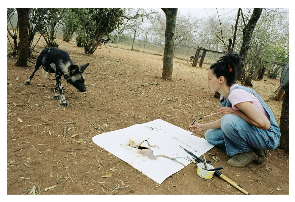
FIG. 7 Documentation of Suzi and Wild Dog, Mkomazi, Tanzania , by Olly and Suzi. 2007. (© Olly Williams and Suzi Winstanley).

Olly and Suzi's art knowingly references a tradition of gestural abstraction often associated with primitivist art. The figurative representations of their animal subjects are executed in a gestural style that draws on the formal properties of expressionist painting, and the interventions of the animals can be seen to reinforce this aesthetic. In Suzi and Wild Dog, Mkomazi, Tanzania, for example FIG. 7, the earth-toned brushstrokes are spontaneous and almost abstract, evoking the emotional intensity of expressionism, even as they cohere into recognisable animal physiognomies. What seem to be paw prints and other marks made by the dogs might thus seem to reiterate the forms painted by the human hand. Once the initial image is created, however, the work develops to combine elements of performance and environmental advocacy in ways that directly confront questions of animal agency and intelligence, rather than presenting the animal paintings solely in relation to artistic standards set by humans.