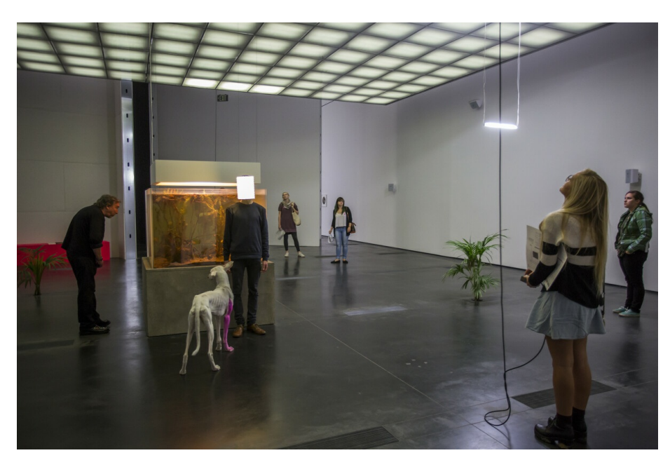
FIG. 15 Installation view of Pierre Huyghe , Los Angeles County Museum of Art, 2014–15. (© Pierre Huyghe).

This rejection of human-centered perception, especially within the art-historical context, is made most explicit in Huyghe's ironic incorporation of Human, a white Ibizan hound with one of its legs painted fluorescent pink FIG. 15.<sup>32</sup> The dog wanders the galleries, seeming at once largely indifferent to the presence of people (much like the bees) and somehow performative (like the ice skaters within the same retrospective, who took to the frozen stage on a set schedule).<sup>33</sup> Museum visitors are instructed to 'refrain from touching, petting or otherwise disturbing her'.<sup>34</sup> In this way, the work frustrates the human desire for certain forms of interspecies interaction. Without a clearly defined relationship established between Human and the visitors, her presence within the space is unsettling. A series of questions arise: who has agency in this situation?; what are the relative positions of the animal and the human in the gallery?; what are the institutional and cultural protocols that determine their interactions?; how do those interactions challenge the boundaries of the institution?