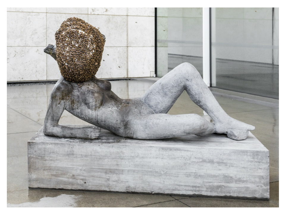
FIG. 10 Untilled (Reclining Nude), by Pierre Huyghe. 2012. Concrete cast with beehive structure and wax. (Ishikawa Collection, Okayama, Japan), installation view of Pierre Huyghe , Los Angeles County Museum of Art, 2014–15. (Courtesy the artist; Marian Goodman Gallery, New York; Hauser & Wirth, London; and Esther Schipper, Berlin; photograph © Museum Associates/ LACMA).

Also on view at LACMA was A Way in Untilled (2012), a video which resituated viewers in the site created by Huyghe for dOCUMENTA 13 . Here, the uprooted oak tree in Untilled FIG. 11 introduces a further art-historical framework of the nature/culture divide, that of land art practices of the 1960s and 1970s, which aim to situate artworks in remote and seemingly uncultivated environments, or conversely to bring elements of 'the wild' indoors. The tree, one of the seven thousand oaks that Joseph Beuys had planted in Kassel for dOCUMENTA 7 (1982), seems to invoke a lineage of contemporary art as urban renewal or environmentalism. Yet unlike in Beuys's project, in which a basalt stone was removed from the lawn in front of the Museum Fridericianum every time a tree was planted – a move that replaces 'art' with nature – Huyghe's work is a nature-society hybrid.