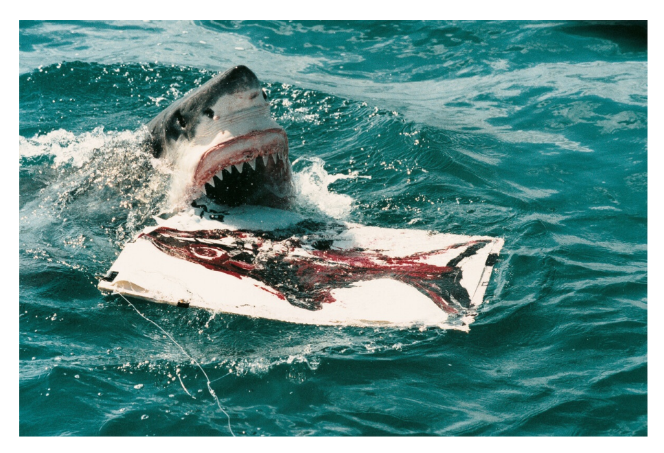
FIG. 4 Documentation of Shark Bite, South Africa , by Olly and Suzi. 2000. Chromogenic print, 40.6 by 50.8 cm. (© Olly Williams and Suzi Winstanley; photograph Greg Williams; courtesy the artists).

draw underwater in close proximity to great white sharks. The artists then mounted the pictures (executed on paper) on large buoyant foam board with the underside covered in dark tones. This created a silhouette that encouraged the sharks to bite into the image-object FIG. 4. In another work, created in the Cayman Islands, stingrays brushed up against paintings, attracted by the squid ink and blood that the artists had used to mark the surfaces of the work. In each of these instances, art becomes one of the triggers that serves to elicit a response from the animal – but it is also not entirely foreign to the environment in which the interaction occurs. The artists are at once instigators and, one might argue, collaborators with these animal participants.