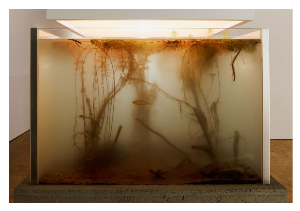
FIG. 14 Nymphéas Transplant (14–18), by Pierre Huyghe. 2014. Live marine ecosystem (Courtesy the artist; Marian Goodman Gallery, New York; Hauser & Wirth, London; and Esther Schipper, Berlin; © ZKM Center for