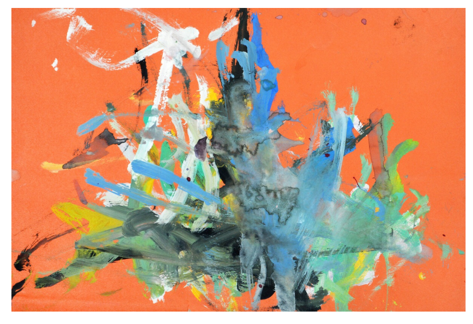
FIG. 6 20th Painting Session, 31st August 1957, by Congo. Oil on paper, 32 by 52 cm.

These experiments gave rise to a more difficult question: do apes 'understand' the compositional logic of painting, or is this display of aesthetic coherence a superficial or reflex response to external stimuli? As Thierry Levain has argued, apes may be able to generate complex compositions that demonstrate a 'visual intelligence', but their paintings constitute only passive responses to the tools and procedures that have been offered to them: