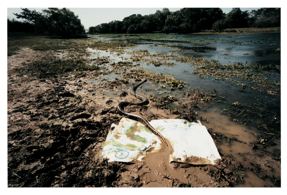
FIG. 8 Documentation of Painting with an anaconda, Llanos, Venezuela , by Olly and Suzi. 2000. (© Olly Williams and Suzi Winstanley; photograph Greg Williams).

This tension around the definition of the artist is made explicit in a project staged in the Venezuelan Llanos, in which the artists set out to produce paintings with the aid of the green anaconda FIG. 8. A species of non-venomous boa that inhabits swamps, marshes and slow-moving streams across much of South America, the green anaconda is the world's heaviest snake and one of its longest, capable of reaching up to five metres. Assisted by a professional snake tracker, Olly and Suzi trapped an anaconda and carried it back to a ranch. There, the artists covered the underside of the snake with a natural paint mix, took relief prints of the animal and then left it to make its own marks on large sheets of paper FIG. 9. They describe the process as follows: