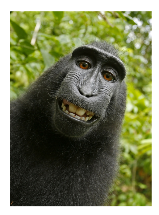
FIG. 3 Self-portrait of a female Macaca nigra (Celebes crested