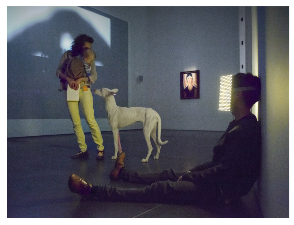
FIG. 16 Human with Player. Installation view of Pierre Huyghe, Los Angeles County Museum of Art, 2014–15. (Courtesy the artist; Marian Goodman Gallery, New York; Hauser & Wirth, London; and Esther Schipper, Berlin; photograph © Museum Associates/ LACMA).