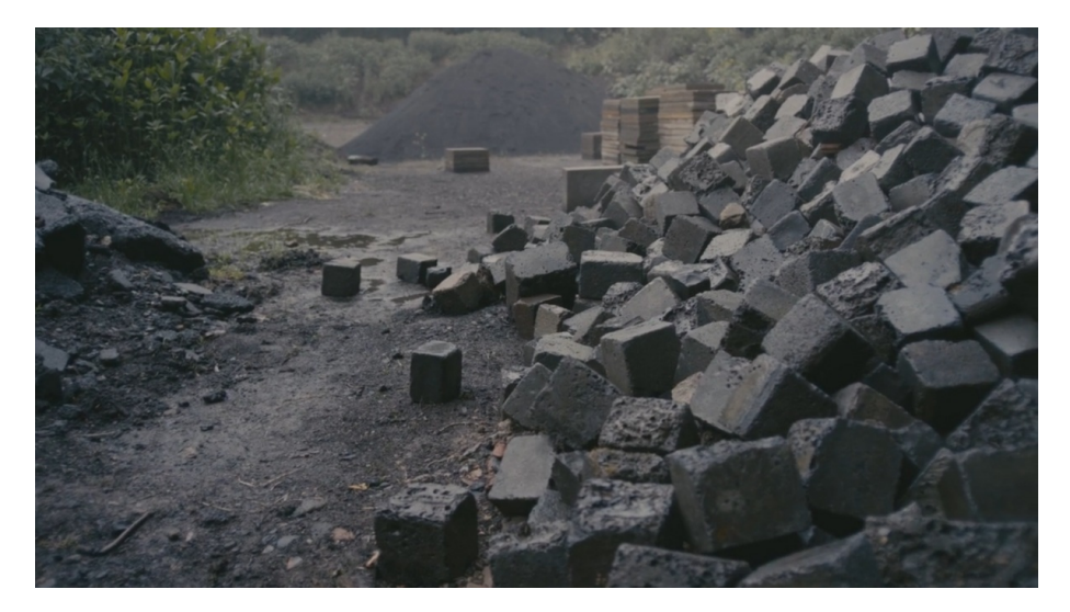
FIG. 2 Still from A Way in Untilled , by Pierre Huyghe. 2011–12. Video, 13 mins 59 secs. (© Pierre Huyghe).

In Huyghe's recent work with living organisms, as well as in projects by the British artists Olly and Suzi (Olly Williams and Suzi Winstanley), who make art in the wild with the involvement of endangered species, non-human animals are enlisted as collaborators in the joint production of works of art across species boundaries. Yet what distinguishes both bodies of work is that they pose a further challenge to the institutional frameworks within which this division has been naturalised. These frameworks cannot be reduced to a discussion of specific art institutions, nor to the material sites of the museum or white-cube gallery. Rather, they should also be seen to include the social networks and discourses that make up the contemporary art world and the discipline of art history.<sup>6</sup> If the museum is a structure that traditionally serves to separate nature and culture, in Untilled Huyghe turns the exhibition into a stochastic platform in which