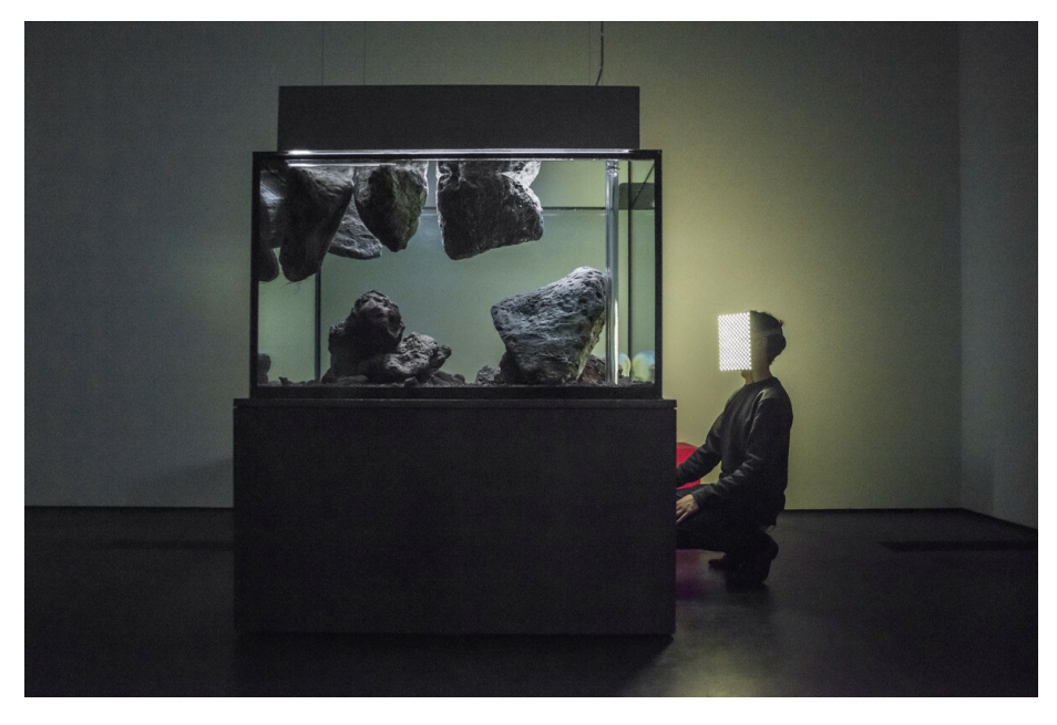
FIG. 17 Plαyer , by Pierre Huyghe. 2010. Installation view of Pierre Huyghe , Los Angeles County Museum of Art, 2014–15. (Courtesy the artist; Marian Goodman Gallery, New York; Hauser & Wirth, London; and Esther Schipper, Berlin; photograph © Museum Associates/ LACMA).

To date, much of the discussion of this work has revolved around the ethics of using a live animal in a work of art. When Human was exhibited in Los Angeles, LACMA took pains to communicate to visitors that the animal was a rescue dog and that its protruding breastbone and ribs were not signs of malnutrition but typical of the breed's general appearance. Moreover, on its blog the museum publicised the fact that the animal had a private resting area and went home each night with her handler.<sup>37</sup> This pre-emptive move is indicative of a wider preoccupation with animal rights that extends across the fields of behavioural science, biology, ethics, law and the humanities. Recent efforts to grant legal rights to animals are premised on the argument that certain species possess capabilities that are fundamental to all persons: selfconsciousness, rational agency, emotional complexity and the capacity to learn and transmit language. Thus, for the founders of the Great Ape Project, a worldwide effort to extend the rights commonly afforded to humans to chimpanzees, bonobos, gorillas and orangutans, the aim is to establish human and nonhuman animals as a 'community of equals' who share basic rights.<sup>38</sup> Yet this model of animal rights remains at odds with a strand of animal studies that questions a perspective that perpetuates the centrality of the human as a measure of the respect due to another species.<sup>39</sup>