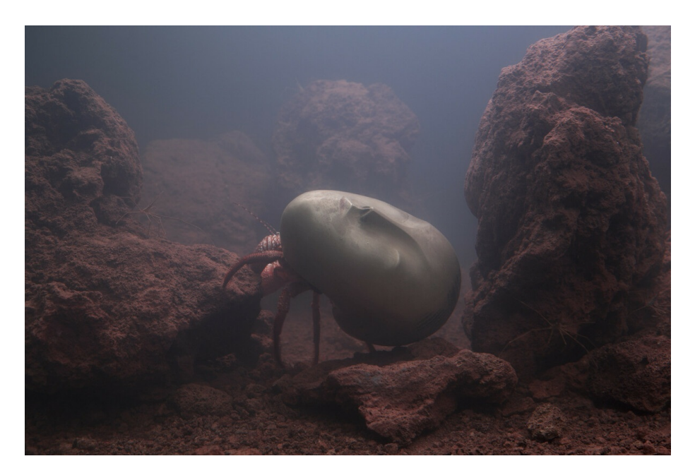
FIG. 13 Zoodram 5 (after 'Sleeping Muse' by Constantin Brancusi) by Pierre Huyghe. 2011. Glass tank, filtration system, resin shell after Constantin Brancusi's Sleeping Muse (1910), hermit crab, arrow crabs and basalt rock, and custom-made light. Tank and Base 154.9 by 99.1 by 134.6 cm.

Other works within Huyghe's 2013–14 exhibition more directly upend human systems of control, most especially those at play in the museum institution. (Untitled) Weather Score (2002), which was positioned opposite Reclining Nude, creates artificial rain, snow and fog with the aid of computer software. Here, natural and artificial systems were made to intersect with one another - so that, in an inversion of the tradition of land art, the institutional space takes on the features of the outside environment. This impulse was carried over into the Zoodrams, large aquariums containing different marine ecosystems. In Zoodram 5 (2011), a hermit crab turned a resin copy of Brancusi's Sleeping Muse into its extemporaneous habitat FIG. 13. Like the prehistoric-looking crustaceans, the volcanic rock in the aquarium operated as a marker of 'deep time', the immense scale involved in measuring geological and evolutionary processes. The work alludes both to a period before humans and to an imagined post-extinction world, bringing nonhuman timescales into collision with the temporal rhythms of the art institution, such as opening and closing times, exhibition calendars and scales of human perception.