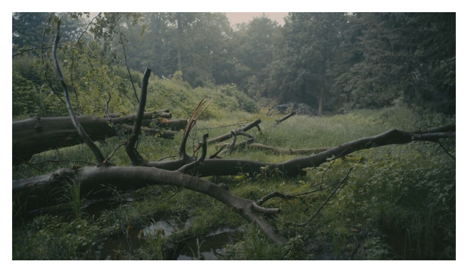
FIG. 11 Still from Untilled, by Pierre Huyghe, showing a fallen oak tree.