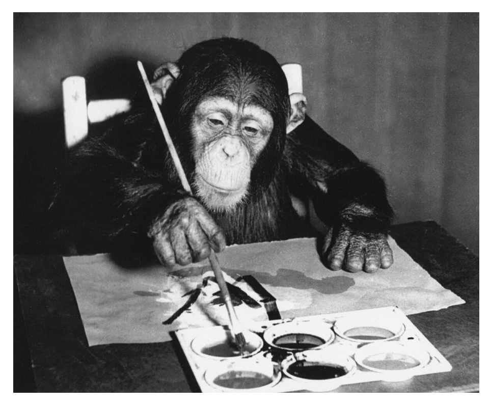
FIG. 5 Congo offered multiple colours. 1957. Photograph.

In the 1950s scientists undertook a series of experiments that aimed to reveal evidence of 'artistic behaviour' in apes. The larger stakes of these studies were to determine how art emerged in the evolutionary process leading from pre-human to human life. The zoologist Desmond Morris was able to show that apes were indeed capable of producing drawings and paintings that followed a compositional logic. According to this line of research, primates demonstrate a capacity and taste for introducing formal variations that share an affinity with the pictorial concerns of Tachisme and Art informel FIG. 5.<sup>18</sup>