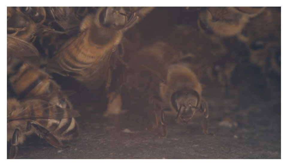
FIG. 1 Still from A Way in Untilled , by Pierre Huyghe. 2011–12. Video, 13 mins 59 secs. (© Pierre Huyghe).