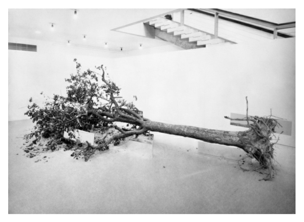
FIG. 12 Dead Tree, by Robert Smithson. 1969. Installation view of Prospect 69, Dusseldorf Kunsthalle, 1969.

FIG. 11 Still from Untilled, by Pierre Huyghe, showing a fallen oak tree.