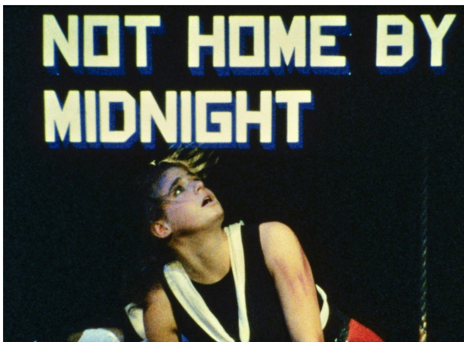
Fig. 1 Still from Cinderella , by Ericka Beckman. 1986. (© Ericka Beckman).

'Try and keep the dress; if you catch the prince you keep the dress'. A duo of voices on the soundtrack of Ericka Beckman's Cinderella (1986) directs these sing-song instructions to the film's titular protagonist FIG. 1 . They introduce the 'rules' of the game, for Beckman's fairytale adopts the structure and aesthetic of early computer adventure games. Bright block colours and dayglo lines stand out against a black backdrop; electronic music and animation blend with live action and handmade props FIG. 2 . The dress, which appears unbidden in a gift-wrapped cardboard box, is a token that initiates Cinderella's quest.