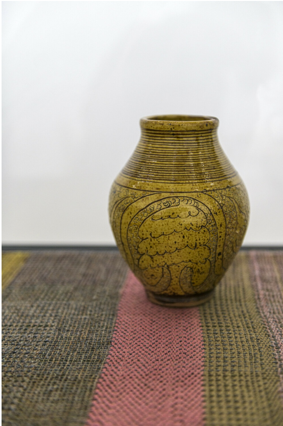
Fig. 7 Installation view of Kai Althoff goes with Bernard Leach at the Whitechapel Gallery, London, 2020. (Courtesy Whitechapel Gallery; photograph Polly Eltes).

Exhibition details Kai Althoff goes with Bernard Leach Whitechapel Gallery, London 7th October 2020–10th January 2021