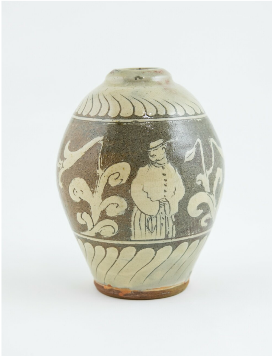
Fig. 2 Solomon amongst the lilies , vase by Bernard Leach. 1926. Stoneware. 21 by 4 cm (mouth diameter). (Courtesy of Leicester Museums; © Bernard Leach Estate; exh. Whitechapel Gallery, London).

The Whitechapel Gallery presents the work of both artists across three galleries, in a non-chronological arrangement. Although ostensibly a coupling, there are in fact three narratives of display present here: the adventurous, unassuming and unusual (Leach); the serious, sterile and institutional (Althoff); and the murky, mysterious and ambiguous (the gallery). The main exhibition space has been converted into an immersive, forest-like environment; a tarpaulin canopy hangs from the ceiling, holding autumnal, withered brown leaves. It is here that the majority of Althoff's work – a varied selection of sixty-four paintings and drawings from the early 1980s onwards – is on display. Across his practice Althoff amalgamates – without directly referencing – a plethora of sources in his work: the memories, feelings and forms of the Vienna Secession; Egon Schiele; Symbolism; Cologne in the eighties and nineties; Stephan Abry; Abel Auer; Joseph Beuys; Michael Buthe;