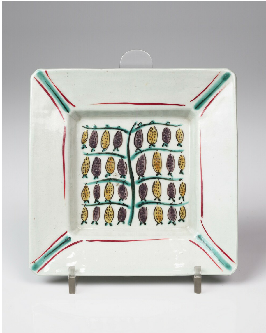
Fig. 6 Square Dish, by Bernard Leach. 1950. Porcelain. 15.5 by 15.5 by 2 cm.

What appears to be a curious coupling at first glance is in fact ‘the perfecting of a love’ – to borrow the title of one of Robert Musil’s lesser-known novellas. Leach and Althoff’s similarities encompass muted colour schemes, a shared interest in Eastern culture, autodidactic appropriations and somatic experiences. Encouraging a return to looking, feeling and experiencing works of art through immersive environments is an honourable undertaking. However in doing so Kai Althoff goes with Bernard Leach omits too much information, leaving many visitors in the dark – or rather, a taupe fog – and reinforces the circle of ‘those who know’ to the bourgeois, erudite and exclusive few.