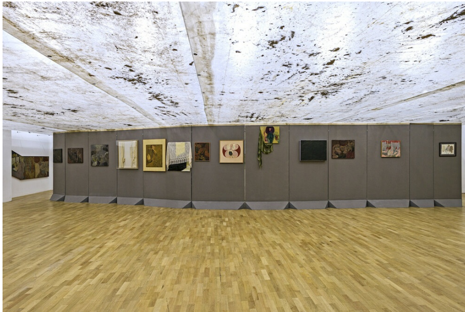
Fig. 3 Installation view of Kai Althoff goes with Bernard Leach at the Whitechapel Gallery, London, 2020. (Courtesy Whitechapel Gallery; photograph Polly Eltes).

Michaela Eichwald; Jutta Koether; and Sigmar Polke among others.